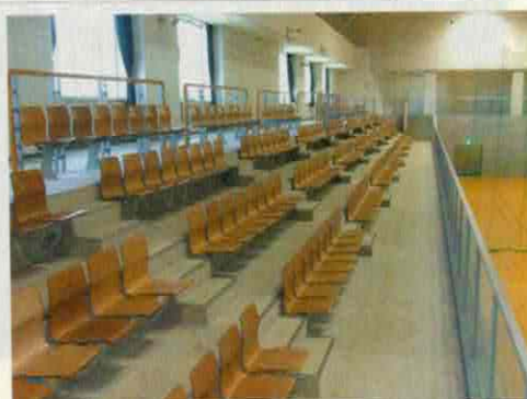
【Main arena view seats】