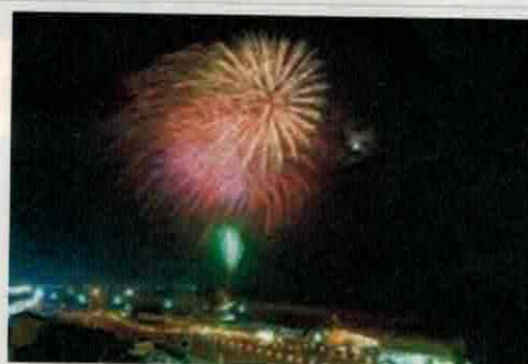
【Iioka- Summer Festival】