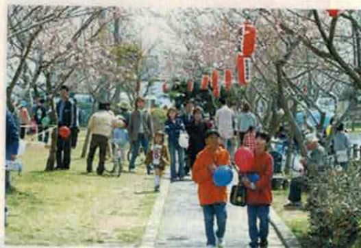
【Cherry Blossom Festival】

Sculpture art exhibition of sand, Summer Festival in Yasashigaura, Tanabata citizen Festival, Iioka- Summer Festival, Sea bathing