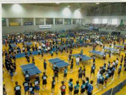
【State of the table tennis tournament】