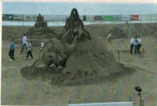
【Sculpture art exhibition of sand】

Sculpture art exhibition of sand, Summer Festival in Yasashigaura, Tanabata citizen Festival, Iioka- Summer Festival, Sea bathing