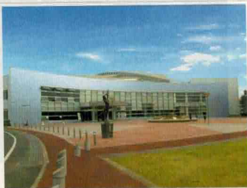
【Asahi City's General Gymnasium】