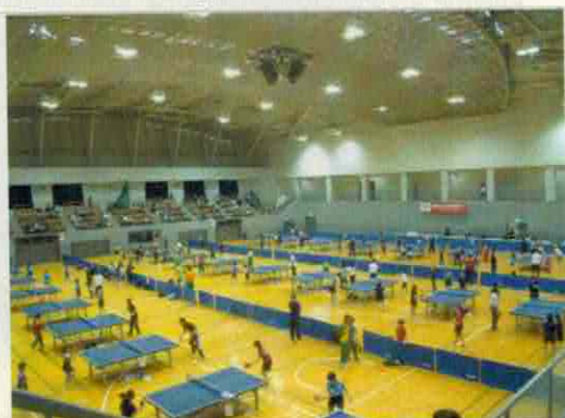
【State of the table tennis tournament】