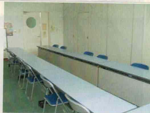
【Conference room 2】