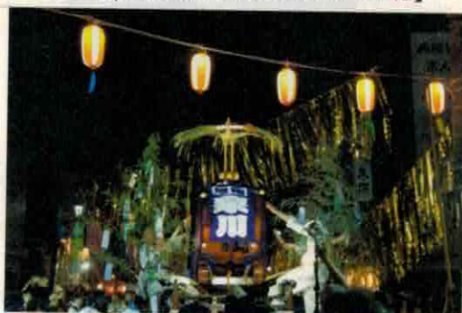
【Tanabata citizen Festival】