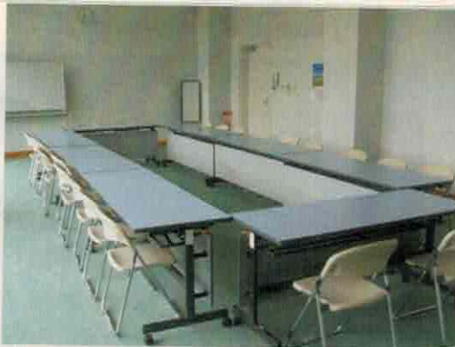
【Conference room 1】