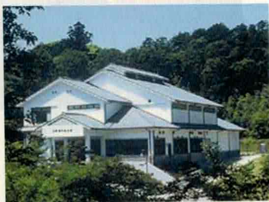
【Oohara yuugaku- Memorial】