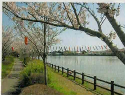
【Cherry Blossom Festival】

Cherry Blossom Festival、Fishing tournament